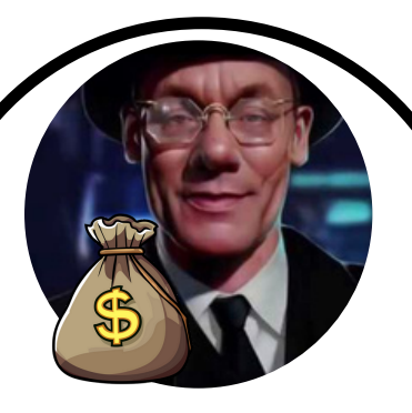
GO BACK 3