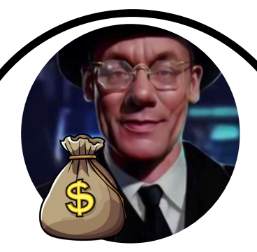
GO BACK 3