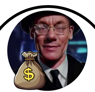
GO BAGN 3