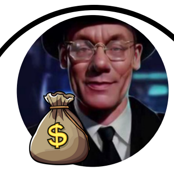
GO BAGN 3