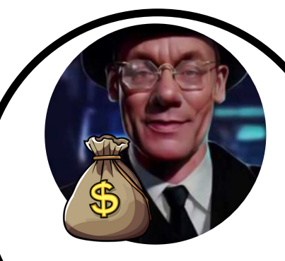
GO BACK 3